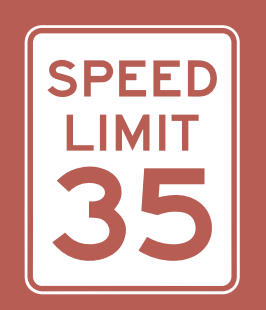
Exceeding the speed limit/ Driving too fast for conditions